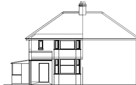
north east elevation