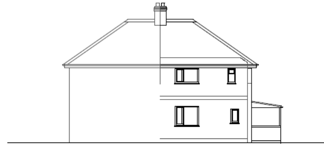
south west elevation