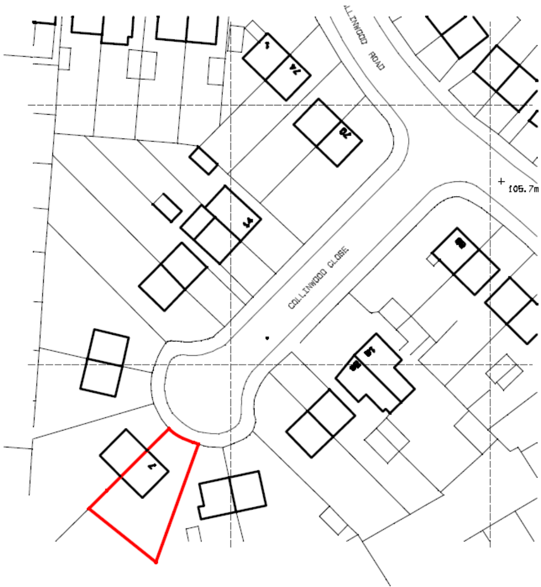
Site location plan